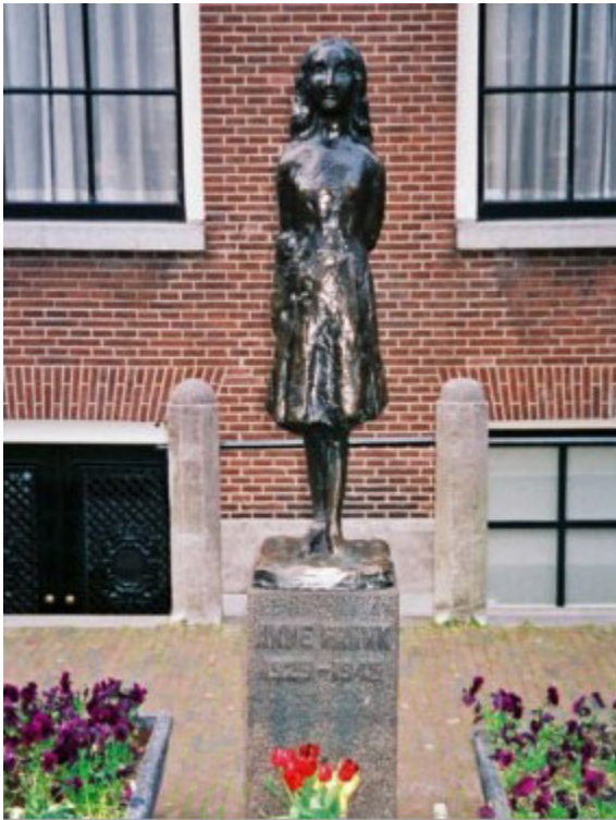
Statue of Anne Frank by Mari S. Andriessen at the Westermarkt in Amsterdam

This 141-page Graphic Biography , sensitively illustrated and written by the collaborative team Ernie Colon and Sid Jacobson, in no way replaces Anne Frank: The Diary of a Young Girl . The Graphic Biography helps people visualize the steps toward becoming an independent thinker and ways to impact on the world.