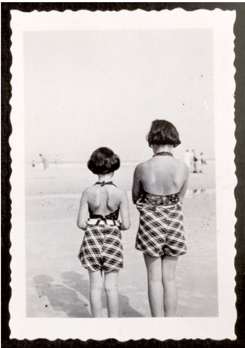
Anne and Margot Frank, The Netherlands, July 1938