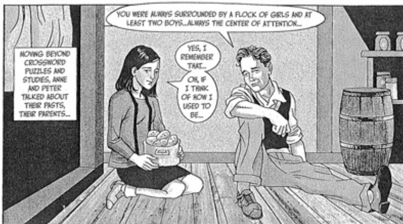
Excerpt from The Anne Frank House Authorized Graphic Biography . Hill and Wang, 2010

On the first Sunday of each month this fall, the AFC USA will host "Anne Frank & Me: A Graphic Narrative Workshop". To celebrate the release of the acclaimed Anne Frank House Authorized Graphic Biography , young persons ages 6 - 16 years will create a graphic story of their own after reading excerpts from the new work. In this engaging activity, students and their families will learn about the unique art form of graphic narrative and the importance of recognizing emotions in storytelling. Participants are invited to bring photographs to incorporate into their drawings.