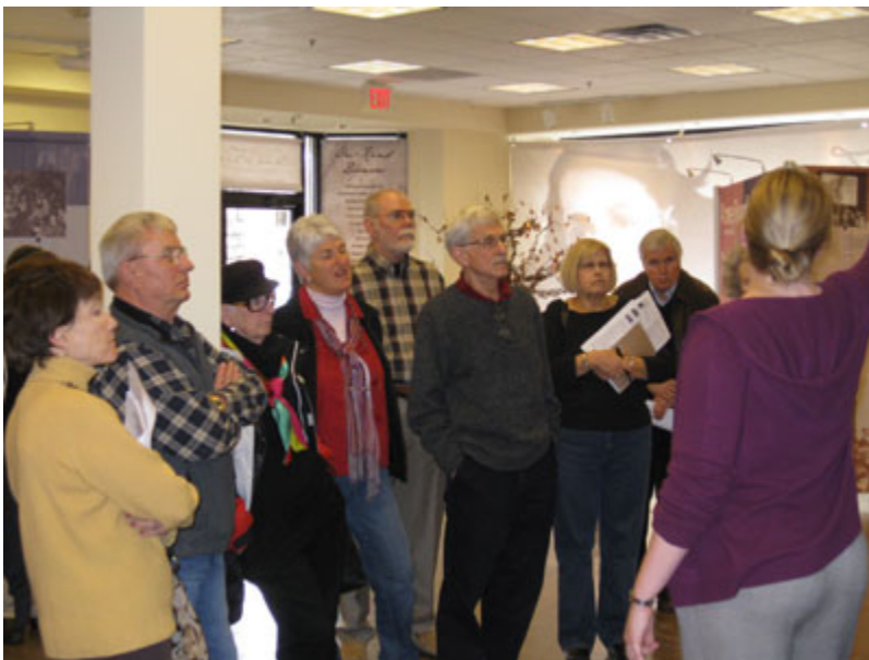
Volunteers and educators at an AFC USA workshop in Albuquerque, New Mexico in preparation for the opening of Anne Frank: A History for Today - Skyline in February 2010

provided professional development to more than 300 classroom teachers from the Museum of the Gulf Coast in Port Arthur, Texas to the Tolerance Center in New York City. Workshops for the fall season include the Fredericksburg Theater in Texas and the Milton District High School in Ontario.